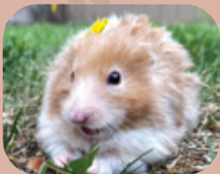
Biscuit, Deer Run