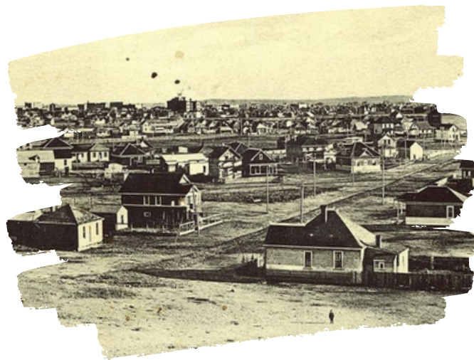
Sunnyside in 1912

In 1948, the Hillhurst Sunnyside Community Association (HSCA) was incorporated as a non-profit society by the Government of Alberta. HSCA is now a registered charity that operates on the leading edge of community serving organizations in Calgary. We champion programs and initiatives that strengthen the capacity of residents to have meaningful engagements with each other and the world around them.