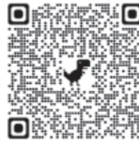
Sunnyside Art Crawl Map

Other things you might do is plant an apple tree or some rhubarb or raspberries in the alley inviting people to come help themselves. A bench giving neighbors a spot to sit is a great way to give the feeling that people gather here. A basketball net or a chalk board shows this space is for play. This space is not always empty. This space is not full of opportunity but is designed for the community. All these ideas make your home feel safer and more connected to the community at large.