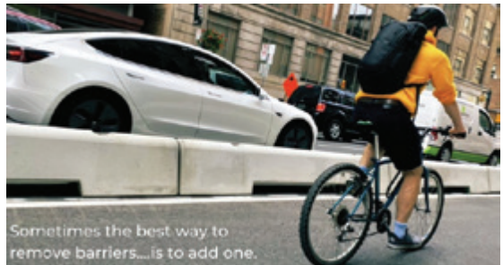
Photo of a separated bicycle lane; the gold standard in safe bicycle infrastructure.

Implementing these bike/pathways will mean some of our street infrastructure will change. Some of our excessively wide roads may have the vehicle lanes narrowed to match the standard width for a 40 km/h street. The place you park your vehicle on the street may also move to a different location. These changes will be a necessary adjustment in order to make safer, more inclusive bike/pathway infrastructure for people.