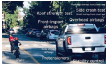
Photo illustrating the relative safety investment made for people in vehicles vs. people in painted bicycle gutters.

What does the 5A Network mean for Hillhurst Sunnyside? Today the pathways and bikeways in our neighbourhood are primarily recreational (Bow River pathway), or servicing commuters passing through our neighborhood to downtown (painted bicycle gutters on 5 Ave, 9A St, and 10 St NW). We also have designated shared roads that are marked with signs or sharrow painted on the road. Unfortunately, these really only serve "the confident and the dedicated"; they don't serve all ages and abilities.