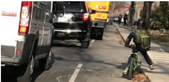
Photo of child pausing while on ride to school. Children are not well served by painted bicycle gutters.

This is an interesting description because it's an acknowledgement that people seeking to ride for non-recreational purposes are not well served. Furthermore, the document is indicating that non-recreational users (commuters) are mostly those who are confident and dedicated riders.