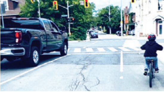
Photo of child biking in an unsafe painted bike lane.

Calgary's pathways and bikeways offer an extensive network that many Hillhurst Sunnyside residents enjoy. However, the City's 2020 Transportation Plan describes the current network as one that only serves "recreational users as well as confident and dedicated cyclists".