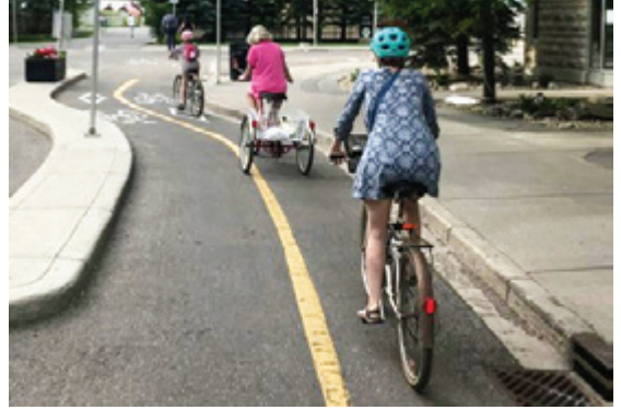
Photo of three generations of women riding on a safe separated mobility lane in Calgary.

so their design-speed matches our residential speed limit. Currently the lanes are wider than lanes on Deerfoot, no wonder people drive too fast. In the space that is created from narrowing the vehicle lanes, protected mobility lanes will be built.